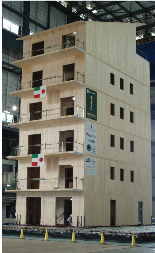
Tested in Japan on the world's largest shake table, this CLT building survived 14 consecutive seismic events with almost no damage.

masonry and steel building types. Even without accounting for the advantages of faster construction time and lower foundation costs (because of CLT's light weight), CLT was found to be cost competitive for mid-rise residential and non-residential, low-rise educational, low-rise commercial, and one-story industrial buildings. 5 CLT is particularly cost effective in large, regularly shaped structures and in situations where fabrication is repetitive.