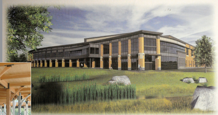
View from Southwest